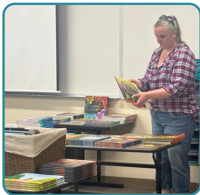
Home Visitor shopping

The quality & selection of books, especially the mental health topics!