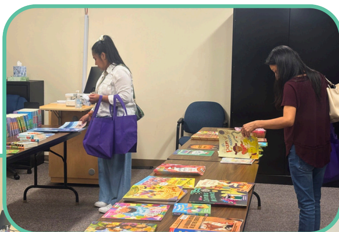
Home Visitors shopping the Diverse Languages Book room