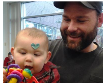
Baby Blast event, 2017

“I have not found anything; I tried to get into one service and the waiting list was 70 people deep, it would be two years before I could get in. I wish someone would have told me how hard infant care is to find.” Did you take any prenatal classes? “Yes, Lamaze.” If you call now and sign up for Lamaze you have the option to start the process for looking for childcare through Pollywog. And she said, “I wish this was around a year ago.”